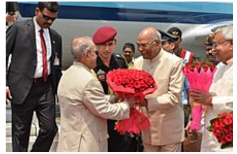
Governor of Bihar Ram Nath Kovind welcoming President Pranab Mukherjee at Patna on April 17, 2017