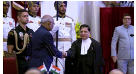
President Ram Nath Kovind with Dipak Misra after administering his oath as the Chief Justice of India on 28 August 2017