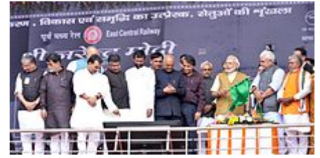
Kovind at a function with Prime Minister Narendra Modi opening a bridge in Bihar, 2016.